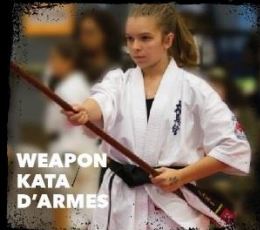
WEAPON KATA D'ARMES